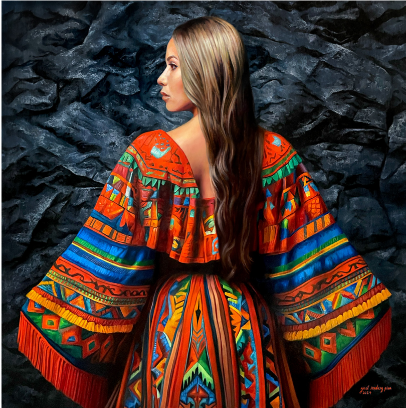
Yael Medrez Pier Ixchel II, 2024 Oil on Aluminum Panel 48 x 48 in (122 x 122 cm) 49 1/2 x 49 11/16 x 1 5/8 in. (framed) 125.73 x 126.21 x 4.14 cm (framed)

A reception for the artist will be held on Friday, January 23 from 5 - 8 pm.